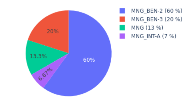
Copy number plot